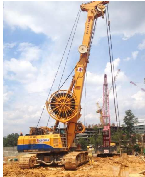
Diaphragm Wall Machine GB46

Beside the quality matter, the platform was a mess during construction due to the overlapping, high traffic of dump trucks and movement of bored pile machineries as well as micropiles and slope strengthening activities. Every activity becomes critical because it would cause delay to the next task if not complete. The slope strengthening could not commence if the slope profile is not achieved, the completion slope strengthening would affect the commencement of the next cutting and bored pile construction near to the slope. It required lots of attention to work sequencing. Overall, the operation team has handled it well with frequent and close coordination among our sub-contractors and our own team.