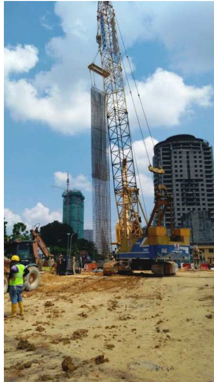
Figure 3 : Lowering 21m long reinforcement cage

Placing concrete is done using tremie pipe to prevent segregation of concrete. When concrete is being poured, bentonite will be displaced and screened off in desander.