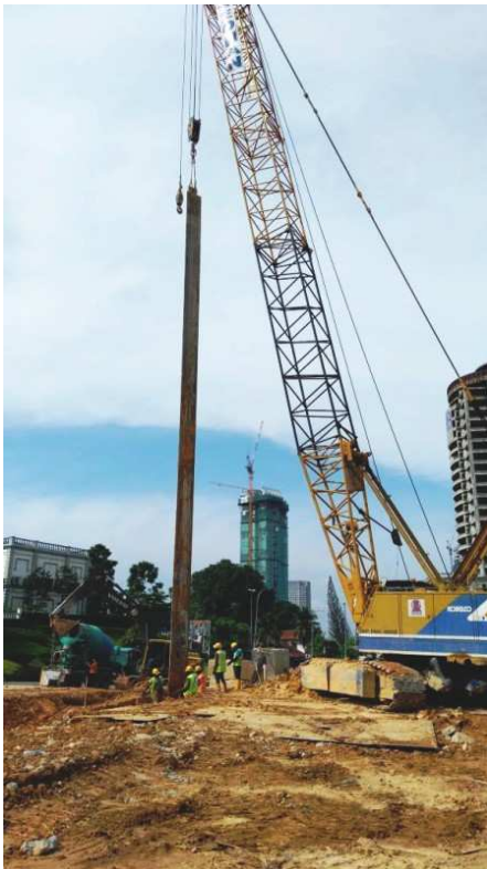
Figure 2 : Lowering 30m long stop end

After completion of desanding operation, stop end is placed into the trench prior to installing reinforcement cage. The purpose of stop end is to form an interlocking shape and watertight connection in between panels. Once the stop end is in place, then only the reinforcement cage can be lowered into position. Tight supervision is mandatory while reinforcement cage is being lifted as every single cage is approximately 10 tonnes and 21m long. Every reinforcement cage has to be hoisted in a balance manner for precise installation.