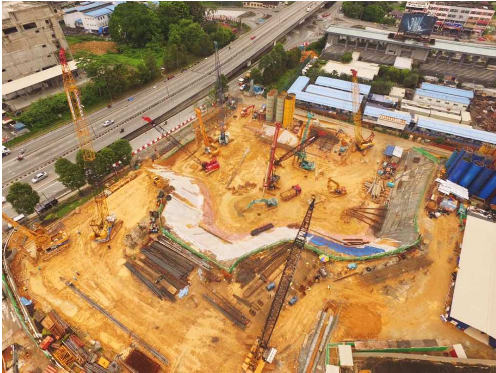
Figure 1 : Site Aerial View

Menara MBBJ is a project development of the new headquarters of Johor Bahru City Council, its a building with 15 storeys office tower and 7 basement car park. This project is located next to Muzium Tokoh Johor in One Bukit Senyum, surrounded by on-going project development of five-star hotel, tallest luxurious residential towers in Southeast Asia and shopping mall. Our work scope is to construct basement retaining wall which is diaphragm wall.